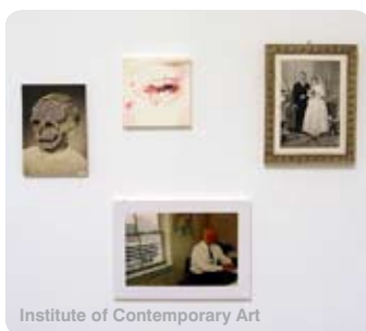
Institute of Contemporary Art

Artists, writers and curators experiment here, exhibiting both local and international artists working across a vast canvas of conceptual, experimental, architectural and non-object based art. 191 Wilson St Newtown