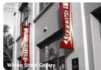
Wilson Street Gallery

Unique, rebellious and spirit-rousing student art fizzles from Verge, an exciting addition to the University of Sydney's campus detonating new exhibitions and open to the public on weekdays from 11am until 3pm. Jane Foss Russell Plaza, City Rd, Darlington (02 9563 6218)