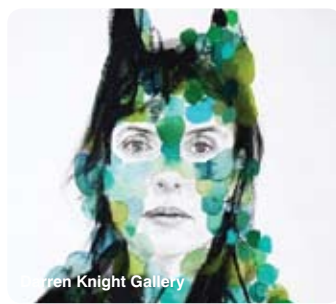
Darren Knight Gallery

The suburb of Waterloo was once a scrapyard for the Sydney psyche, dark in soul and street life. But from the ashes of the old badlands an amazing arts and food precinct has blossomed with Danks Street at its heart. This creative complex opened in 2001 and today is a hub for galleries, arts dealerships, a working jewellery studio and an award-winning cafe and bar. 2 Danks St Waterloo