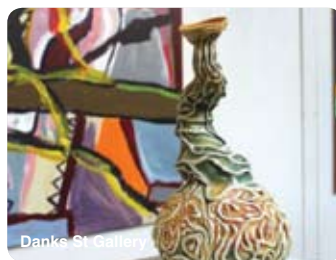
Danks St Gallery