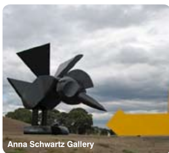
Anna Schwartz Gallery